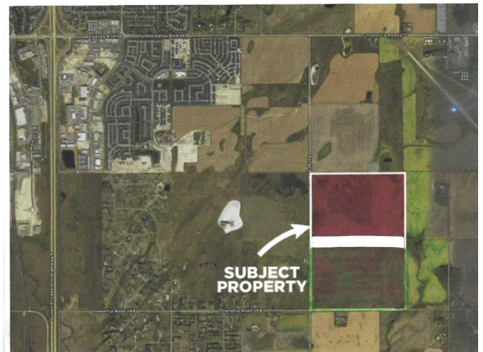
Balzac East Area Structure Plan