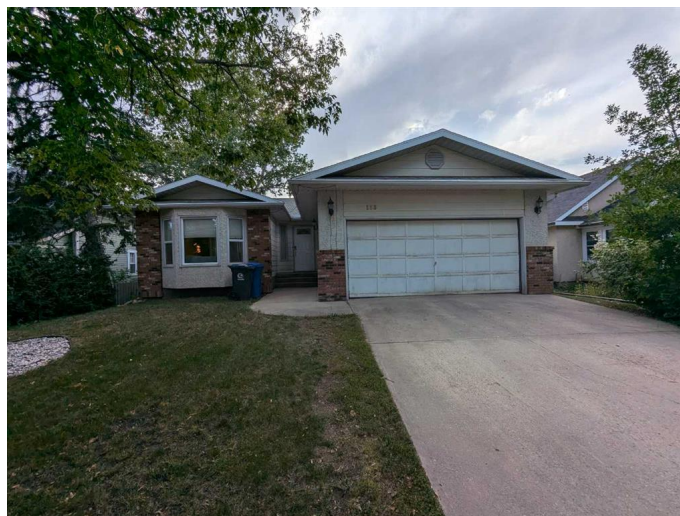
133 6 Ave SE, Three Hills, AB

This home is walking distance to down town and so close to the school and playground you can watch the kids walk all the way. Welcome home! Enter into a smart front entry layout, with the attached front garage entrance and front entrance side by side into the large living room with attached formal dining room, loads of natural light through recently updated triple pane vinyl windows. The kitchen boasts custom oak cabinets, double floor to ceiling pantry, an island with barstool height seating, recent appliances and a step down to a second dining space, perfect for a breakfast nook, home office, informal dining or other cozy space with a beautiful stone wood fireplace. The main floor living space has a large primary, with a large bay window, walk in closet and 3 piece ensuite, 2 more bedrooms, and a full bath plus main floor laundry-front load. The fully finished basement is spacious, with a bedroom, den, a family room with gas fireplace a large rec space, storage and cold room! Step outside to a fully fenced yard and deck, a 12 x 20 storage