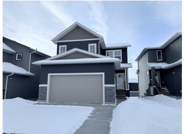
The REDMOND II 2,000 sq. ft.