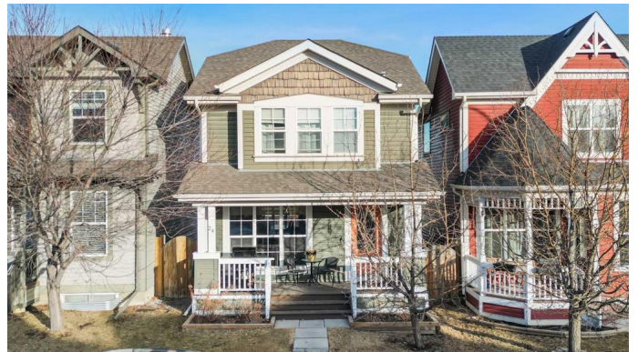
24 AUBURN BAY CRESCENT SE REC-A MEASUREMENT STANDARD - CALGARY, AB MAIN LEVEL (AG) - 680.00 Sq Ft / 63.17 m 2 UPPER LEVEL (AG) - 680.65 Sq Ft / 63.23 m 2 TOTAL ABOVE GRADE RMS SIZE - 1,360.65 Sq Ft / 126.40 m 2

Jewel of a Deal!!! Convenient Location - Steps away from the Lake, ponds, Ice rink, parks, pathways, schools, shopping, transit, South Pointe Hospital, Seton YMCA, and the new exits. A wonderful URBAN STYLE HOME with many upgraded features & meticulously crafted by the original owner - Truly a family home. Over 1360 SF of living space offering 3 bedrooms, 2.5 baths & a big backyard... Check out the floor plan! This OPEN design features a spectacular CHEF'S kitchen looking over the dining area and great room. Upgraded Fit & Finish features include: 3-way gas fireplace, hardwood floors throughout the main floor living areas, light & plumbing fixtures, baseboard, doors and casings... and so much more! The kitchen is masterfully designed for efficiency and entertaining (maple raised panel doors & trims), granite counter tops, upgraded stainless steel appliances (gas stove) & over the range microwave, pantry, computer work station, tiled backsplash, dramatic central island with pendants, raised eating bar for three & under mount stainless steel sink. Upstairs includes an oversized primary bedroom with a full ensuite (Big soaker tub with shower head) and a separate supersized walk-in closet open to the below staircase with railing and two good-sized spare bedrooms. Other impressive features include an Unspoiled basement, a big backyard with a wood deck, a fully fenced backyard, rich front curb appeal with a full-width verandah, and a covered entry. May 22 possession date! Call