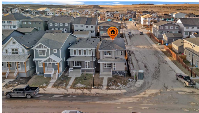
71 Herron St NE, Calgary, AB

Main Floor Exterior Area 914.55 sq ft Interior Area 834.87 sq ft